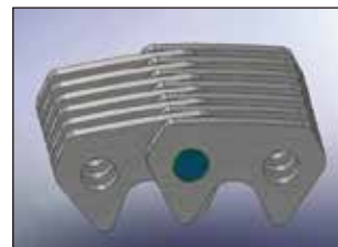
圆销式静音链 Round pin type silent chains

Round pin type silent chain is mainly used for transfer case and gearbox assembly drive system, which is the core component of the drive system. The chain is made from superior quality steel and the plates of which are austempered, which is especially suitable for various conditions such as high strength, high wear resistance, low noise and big torque etc..